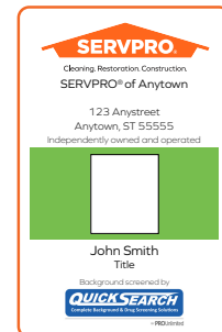
Badges with photos

With their custom, applicant-focused mobile screening portal known as SwiftHire, Quick Search helps make sure you can start the screening process now. Faster speed to hire for you and better applicant experience for your candidates and employees. With SwiftHire, you can put the final forms right in your applicant's hands, reducing candidate information input time and increasing your completion rate.